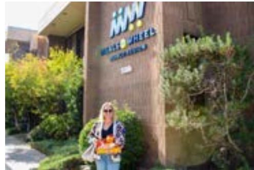
Holiday Wreaths from Girl Scouts! Decorated Pumpkins from the NCL!