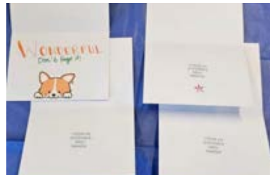
Thinking of You